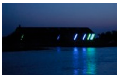
Project of the City of Venice for the Biennale 2009: " The Light of Sant'Erasmus "