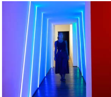
Time Space Existence /Venice Biennale of Architecture 2016